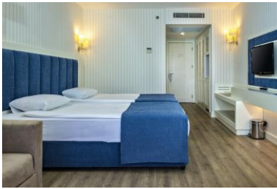
** Comfort Std. Land Room **

** Land View, Side Sea View and Sea View alternatives are available.