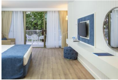
** Comfort Std. Land Room **