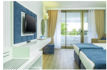
** Comfort Std. Sea Room **