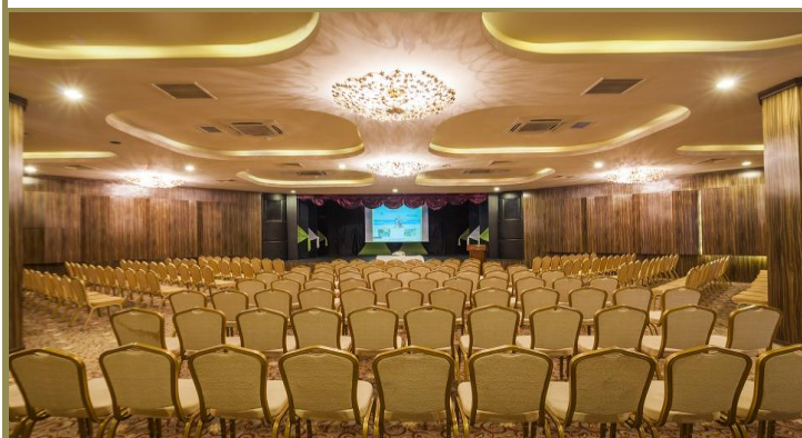
Myra Meeting room

For group accommodation and a detailed list of equipment you can contact our sales department.