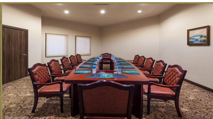
Prince Meeting room