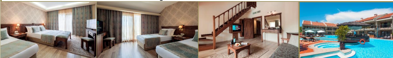
Select Senior Suit (1.Floor)